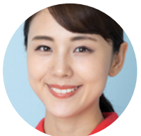
Your Care Coordinator