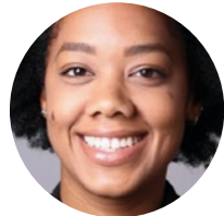
You, the member

A Registered Nurse and a Social Worker can help you with your medical needs, as well as community and social services.