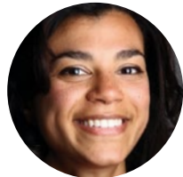
Registered Nurse/ Social Worker