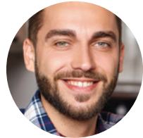
You, the member

Our Care Coordinators will help you manage your medical needs, as well as connect you to community and social services.