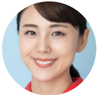
Your Care Coordinator