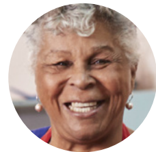
You, the member

Our Care Managers and Nurse Care Managers will help you manage your medical needs, as well as community and social services.