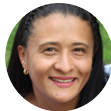
Your Care Manager