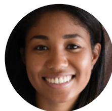
Nurse Care Manager